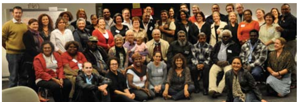
Below: NIACA meeting.