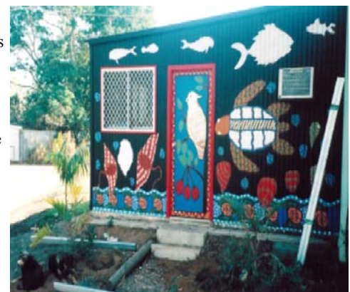
Munupi Arts and Crafts Cultural Centre mural. Photo courtesy of Munupi Arts and Crafts ©

Story by Carly Davenport email: munupi@bigpond.com