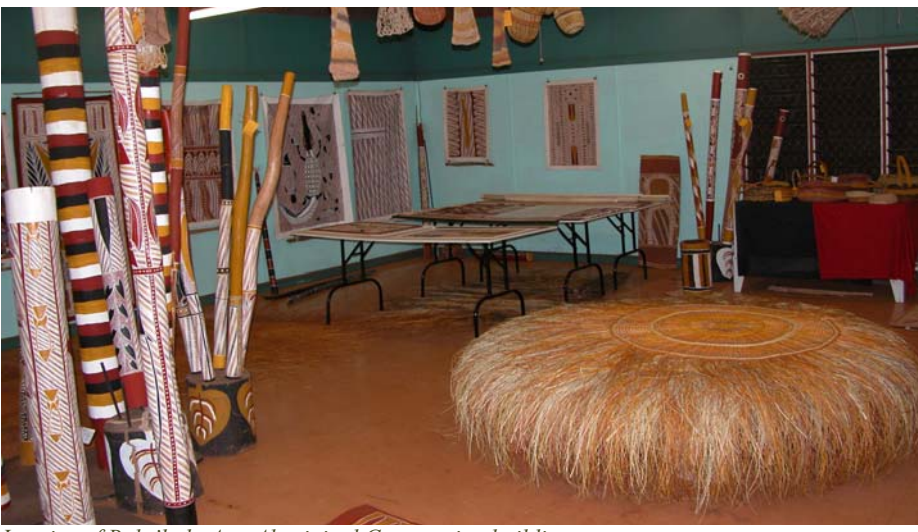
Interior of Bula'bula Arts Aboriginal Corporation building

These are exciting times for Bula'bula Arts which is re-situating itself both in the market place and in the eyes of its artist members and Executive Committee.