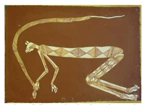
Nakarindhilba, Bardayal Lofty Nadjamerrek, ochre on paper, 2003

these lines. Bardayal alternates wet on wet, lines graduating from red to yellow then back to red and on. Nakadilini's rarrk is more delicate but just as deliberate using the same palette, but one colour at a time. Neither has a particularly steady hand, (in contrast to many traditional line makers of the Top End) but Nakadilinj achieves both a delicacy and a finesse that is characterised by its solid continuity. But firstly and like Nakadilinj, Bardayal's initial marks of the cartoon are modeled rather than drawn, pushing out the shape from within its edges. If the line needs to be brought back in, a painter's finger in a confident and incidental swipe or rub will correct the form. Both paint the ordinary, the everyday stuff