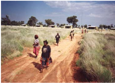
Nynmi outstation, west of Kiwirrkurra with artists going to have a look at the flooded soak water of Nynmi. © 2001

In early October Warlayirti Artists took ten artists for a trip back to country. The original plan was to travel the Canning Stock Route to Well 33 and then head east. Last minute enquiries revealed that the track was flooded at the both ends, so rather than cancel, it was decided to travel the long detour via the west coast.